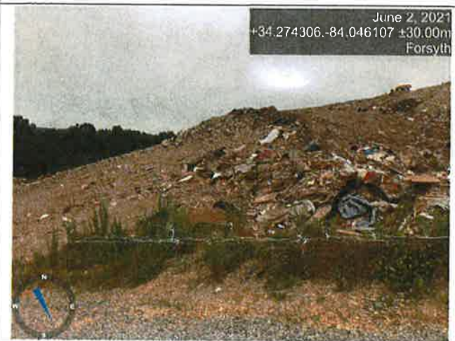
Photo Number: 3 of 4 Date: 6/2/2021 Time: 8:30 a.m. Weather: overcast Location: Greenleaf Recycling Landfill County: Forsyth Observations: Landfill not functioning in accordance with permit, C&D material left uncovered, although no additional waste is being brought to site.