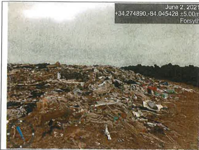
Photo Number: 1 of 4 Date: 6/2/2021 Time: 8:30 a.m. Weather: overcast Location: Greenleaf Recycling Landfill County: Forsyth Observations: Size of workface needs to be minimized

Type of Inspection: Routine Inspection of Greenleaf Recycling Landfill #058-13D (C&D) Inspector Name: Jason Rogers Facility Name: Greenleaf Recycling Landfill #058-13D (C&D) Location (Adjacent): 4512 Keith Bridge Road, Cumming, GA 30041(Forsyth County) Facility Contact: Brian Grizzle Contact Phone No.: 770-888-3355