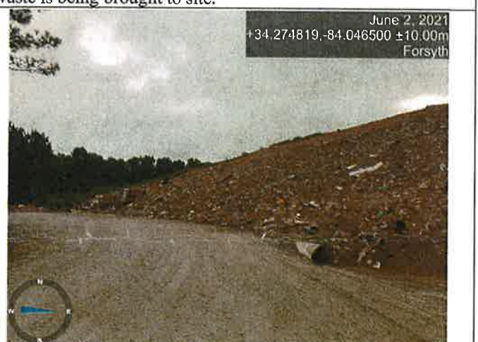
Photo Number: 4 of 4 Date: 6/2/2021 Time: 8:30 a.m. Weather: overcast Location: Greenleaf Recycling Landfill County: Forsyth Observations: Exposed litter on landfill area outside of working face.