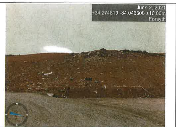
Photo Number: 2 of 4 Date: 6/2/2021 Time: 8:30 a.m. Weather: overcast Location: Greenleaf Recycling Landfill County: Forsyth Observations: Landfill not functioning in accordance with permit, C&D material left uncovered, although no additional waste is being brought to site.